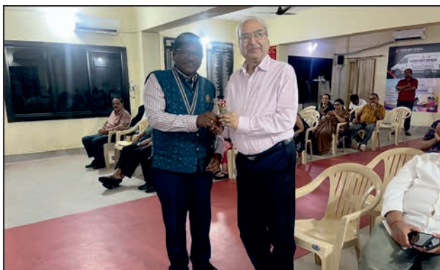
Welcoming PDG D.N.Padhi IAS (Retd.)