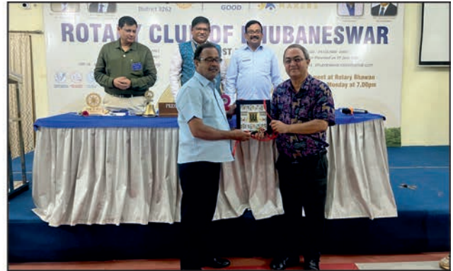
Felicitating IPP for his good works during his tenure