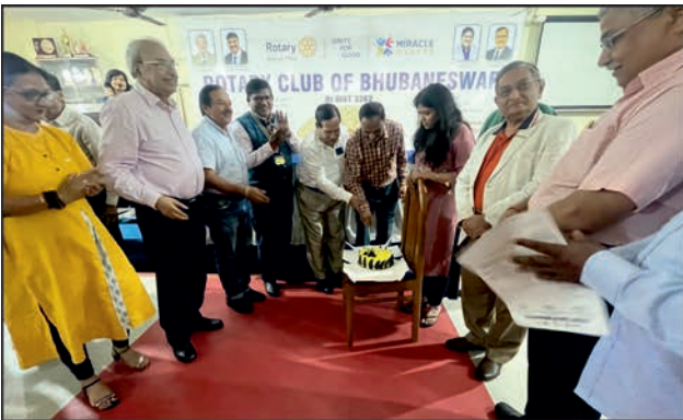
Members cutting cake on their Birthdays and Anniversaries