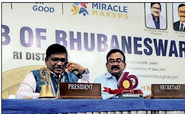
1st weekly Meeting of Ry 2025-26