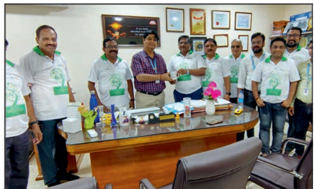
With Principal REC During Plantation Program