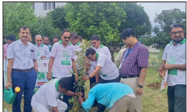
Plantation Drive at Rajdhani Engineering College..... Over 60 Saplings were planted with active participation from Rotarians, Professors and Students